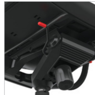
KT mechanism (4 locking)