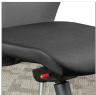
Flat seat (Fabric, PVC)