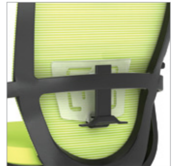
Plastic Pad Nylon reinforced fiberglass