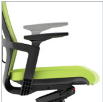
Seat depth adjustment Armrest up or down adjustment