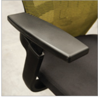
Kaya armrest (plastic) • Armrest up-or-down adjustment, forward backward adjustment