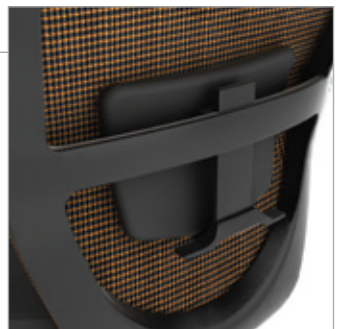
PU Pad Foam wrapped with Lycra fabric