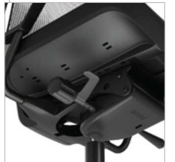
MC mechanism (4 positions tilt limiter)