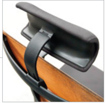
Headrest adjustment Can be with or without headrest