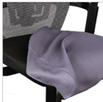
Changeable seat cover