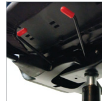
2013 mechanism (single locking)